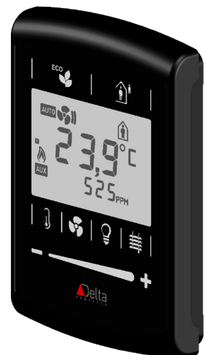
BBB: Black Button Overlay, Black Front, Black Back