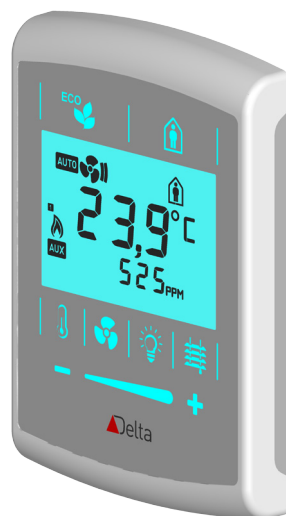
GWG: Grey Button Overlay, White Front, Grey Back