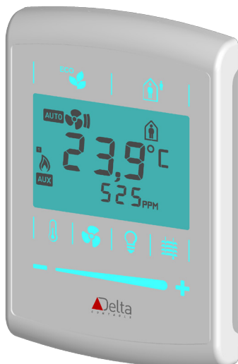
WWG: White Button Overlay, White Front, Grey Back